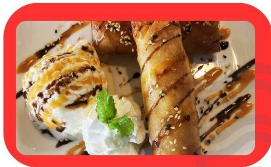
BANANA SPRING ROLL $8

Bananas rolled in spring rolls and deep fried. Served with a scoop of vanilla ice cream drizzled with caramel and chocolate syrup and a dollop of whipped cream