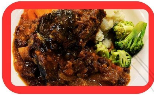
LAMB SHANK $33.5 "OSSO BUCCO"

Braised low and slow lamb shanks in a hearty wine- and vegetable-based sauce. Served with mashed potato and veggies.