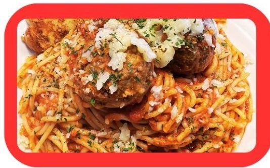
SPAGHETTI WITH $22.95 MEATBALLS

Braised low and slow lamb shanks in a hearty wine- and vegetable-based sauce. Served with mashed potato and veggies.