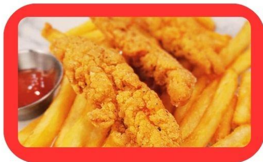
CHICKEN FINGERS AND FRIES Crispy chicken strips served with our famous crispy fries $10|ADULT-$15